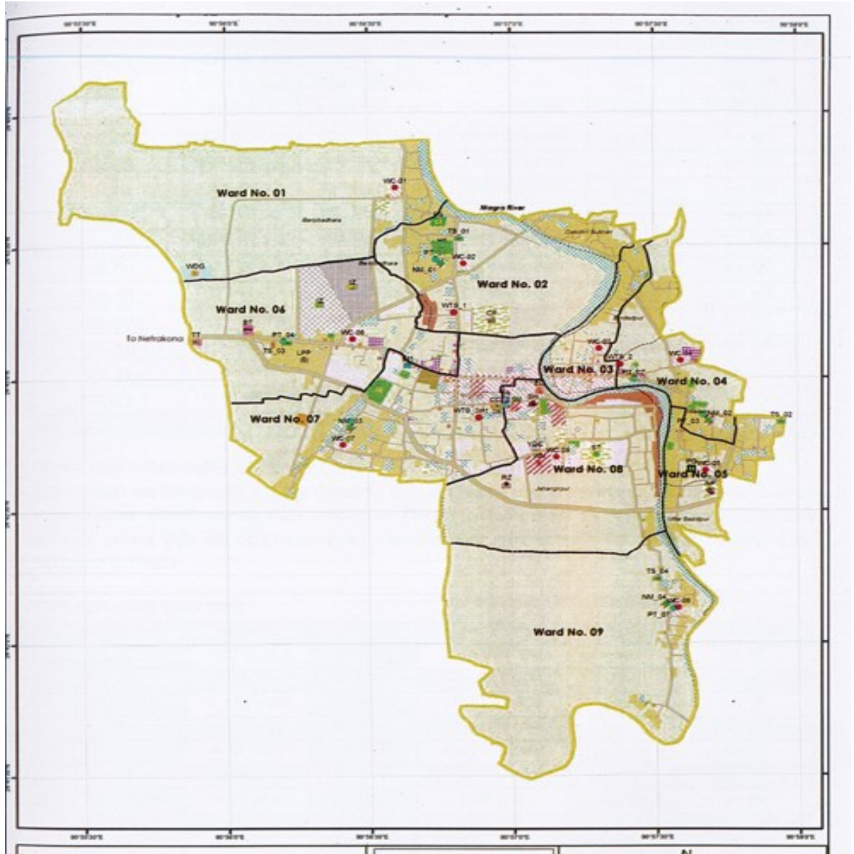
Figure 1: Map of the Faridganj Pourashava

The sub-project will be implemented on the Faridganj Pourashavas own land.