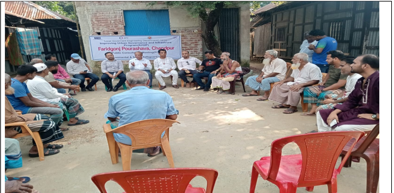
PCM at 04 no. Ward Faridganj Pourashava