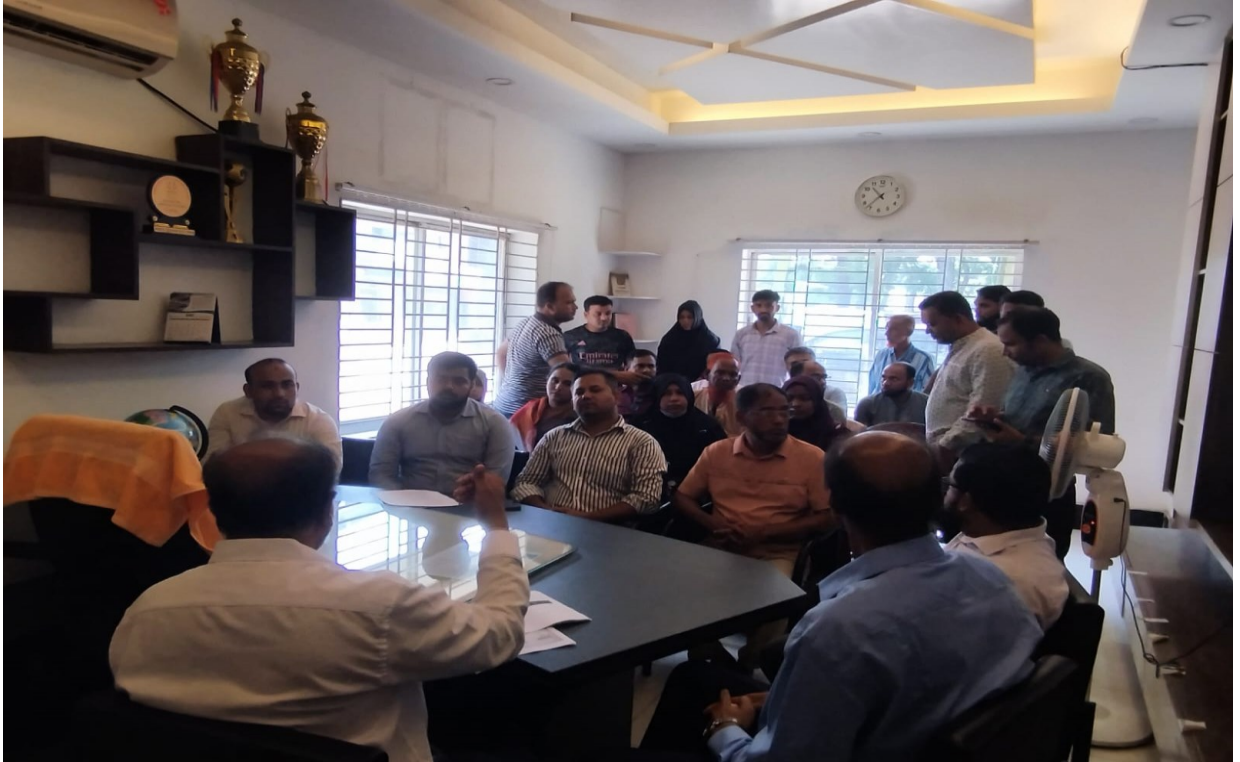
Figure 4: Consultation with Faridganj Pourashava Officials

positive impacts in spite of a few temporary impacts/concerns limited to construction period only, which have the scope of mitigation.