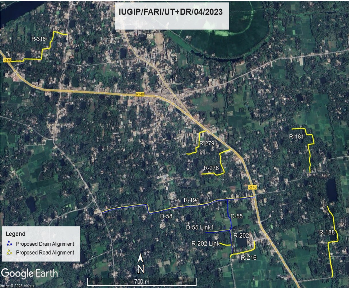
Figure 2: Google Map Location of Road and Drain Improvement sub projects